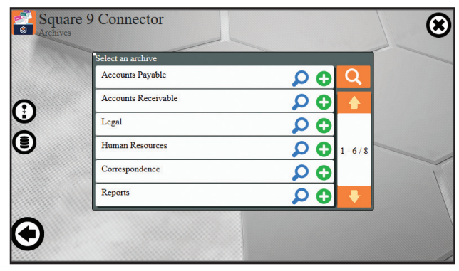
Users can search the Square 9 archive database directly from the MFP and print the document.