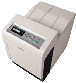
The FS-C5300DN with standard configuration