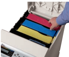
Easy-to-replace toner containers

Kyocera Mita America's objective is to manufacture superior products with a low Total Cost of Ownership (TCO) and minimize the impact on the environment. Kyocera's ECOSYS printers incorporate a patented long life drum which is separate from the toner container, eliminating the need to replace the drum when toner is depleted – and reducing landfill waste.