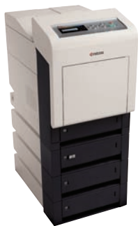
FS-C5300DN with full configuration