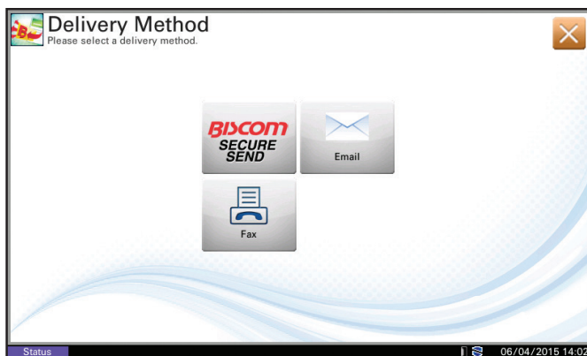
Multiple delivery options for users

KYOCERA's HyPAS (Hybrid Platform for Advanced Solutions) is a powerful and scalable software solution platform. Through direct enhancement of the MFP's core capabilities, to the integration with widely accepted software applications, HyPAS will enhance your specific document imaging needs, resulting in improved information sharing, resource optimization and document workflows.