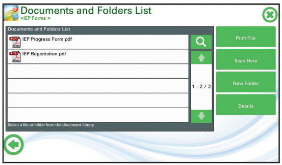
View existing documents and folders on the MFP control panel.

Using the Single Sign-on authentication feature provides additional security when logging on to the MFP. Users can access the MFP easily with a single card swipe.