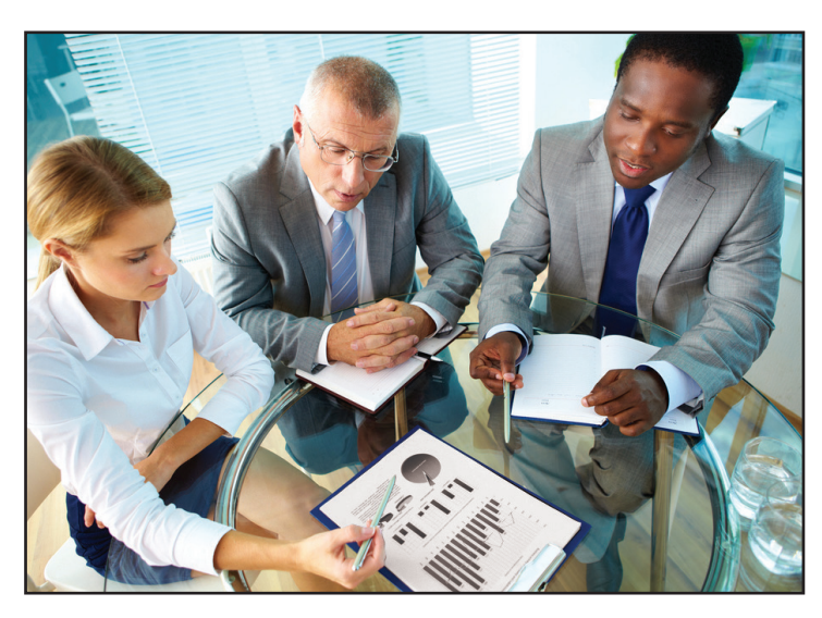
KYOCERA'S RIGHTFAX CONNECTOR HELPS AUTOMATE FAX COMMUNICATIONS BY CONSOLIDATING ALL FAX FUNCTIONALITY TO YOUR MFP'S CONTROL PANEL.

Many paper-intensive industries such as healthcare and financial services, rely upon fax as an essential component of their daily workflow. Its ability to provide an end-to-end audit trail makes fax an invaluable tool for the security and compliance requirements these highly regulated industries are tasked with. For large businesses in particular, a scalable, enterprise fax solution is essential to maximize productivity and cost-savings not achievable with standalone devices. KYOCERA's RightFax Connector can help your organization meet these challenges by harnessing the power of your KYOCERA MFPs and your OpenText® RightFax Server to create a fully integrated solution.